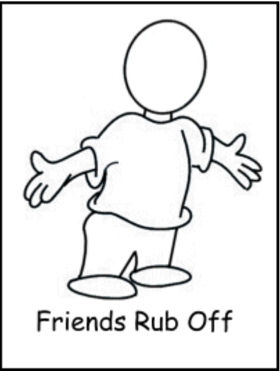
Friends Rub Off