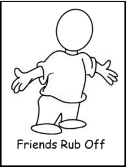
Friends Rub Off