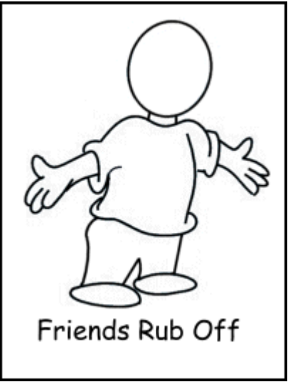
Friends Rub Off