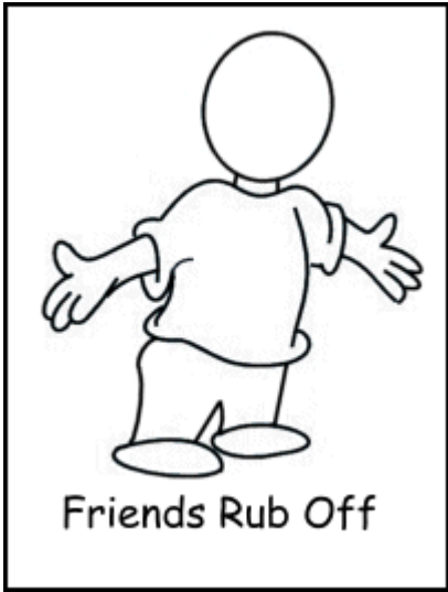
Friends Rub Off