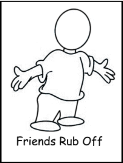
Friends Rub Off