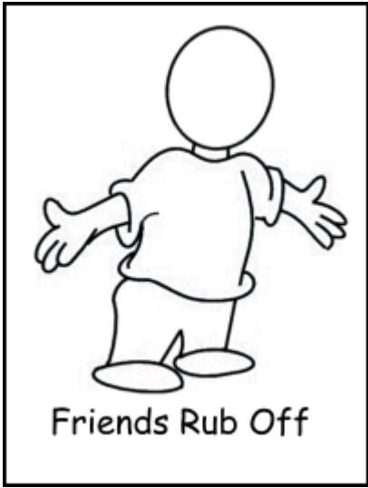
Friends Rub Off